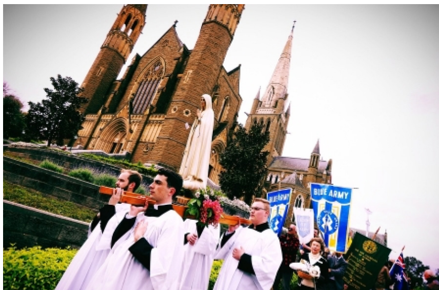
A Procession around Sacred Heart Cathedral Bendigo in the afternoon.