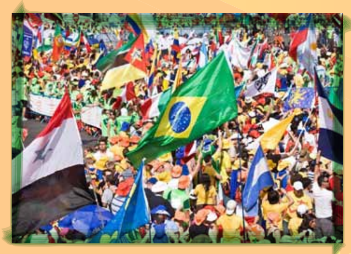
The risen Christ sent his disciples forth to bear witness to his saving presence before all the nations, because God